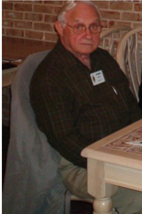
Former RCARC Member