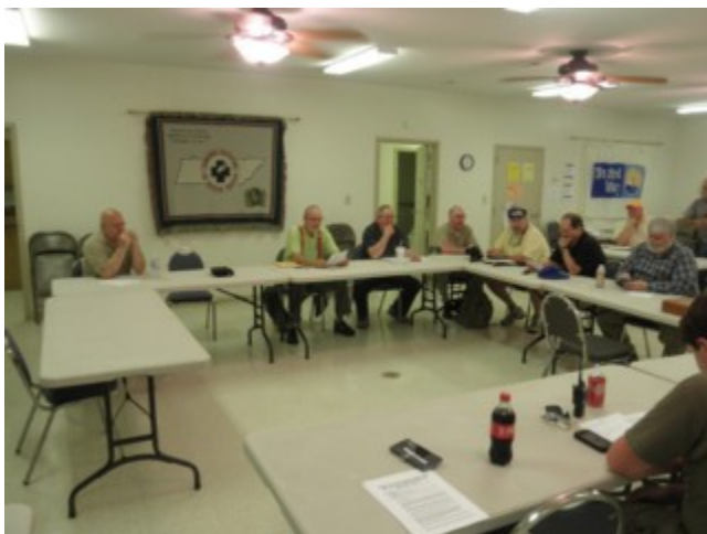
Great Turnout at the RCARC May Meeting!!